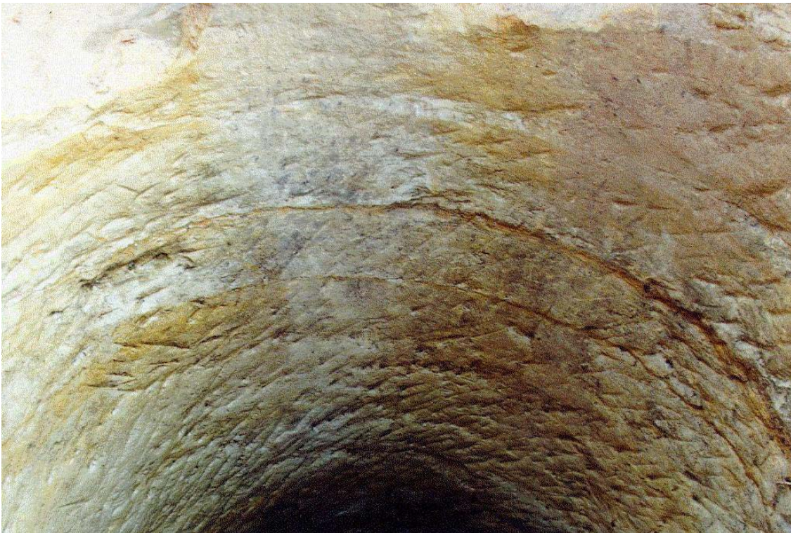
Photo 5.7: Eastern face of inside of cistern with pick marks. The marks were mostly made from right to left. CP4/22.