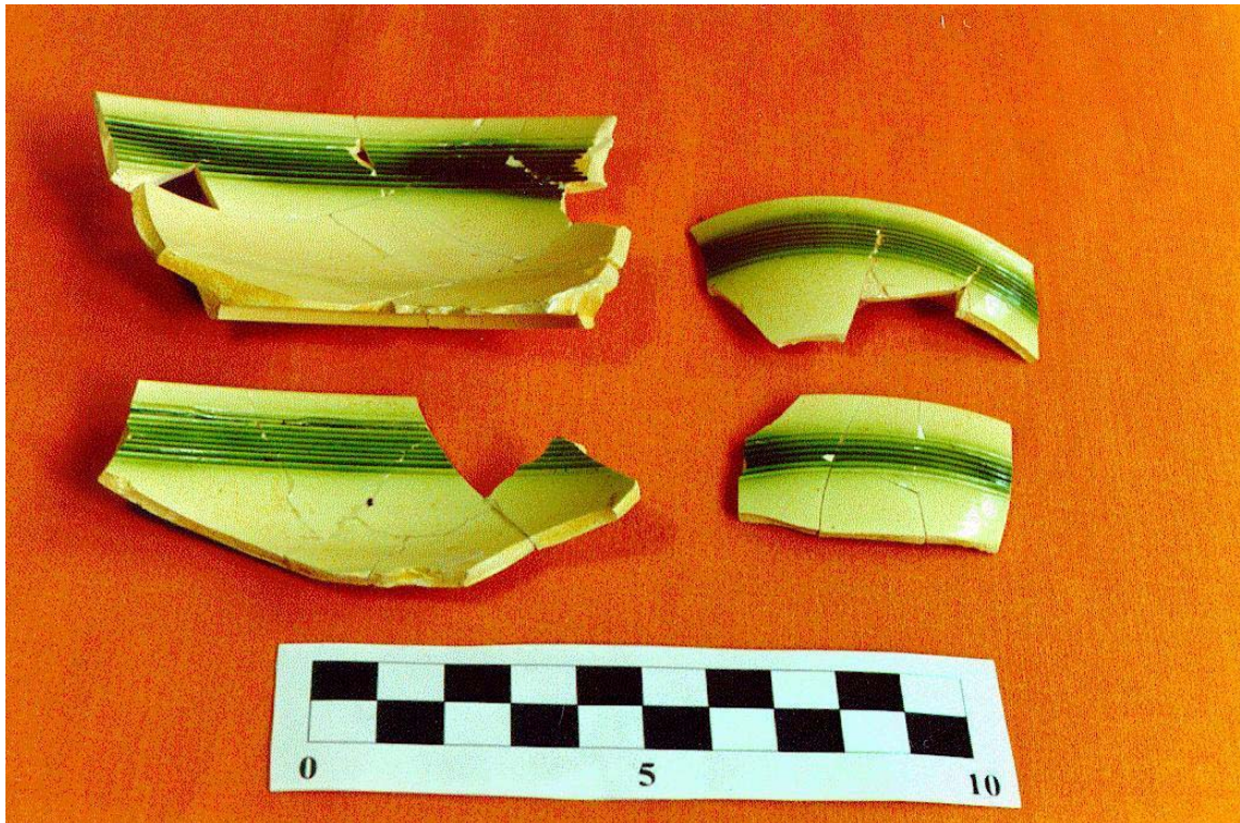
Photo 5.5: Annular creamware cup (right) and saucer (left) found in alluvial deposit #1005. Scale 10 cm. Photo 93/24.

The most common food-related activities that the artefacts (not including bone or shell) from #1004, #1005 and #1034 were associated with were: preparation (13%), serving (3.1%), tableware (53.6%) and tea wares (20.3%) (Table 1000.7). This pattern conforms with some early sites where there is a higher proportion of tablewares over teawares, while at sites from the second half of the nineteenth century there is commonly a higher proportion of teawares than tablewares. 7