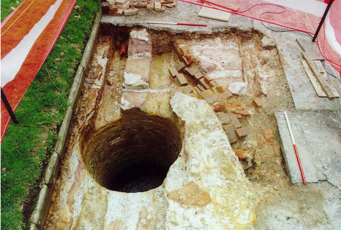
Photo 5.6: View to west showing cistern and adjacent section of underground drain. CP 3/30.