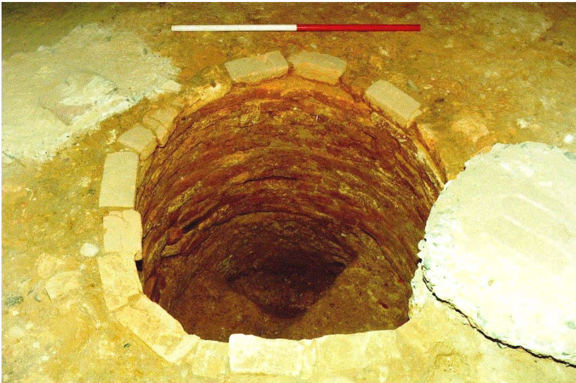
Photo 5.4: View to south of small well (#1019) inside the bakehouse footings partially excavated down to top of bedrock. Cement pier base from Verbrugghen Hall footings on right. Scale 1 m. CP 90/13.