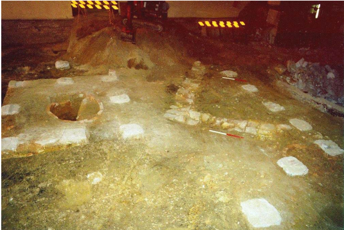
Photo 5.1: View to the northeast over eastern room showing the most intact section of bakehouse remains. Scale 1 m. CP 82/28.