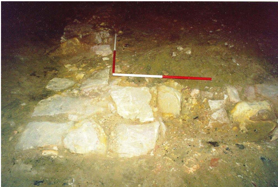
Photo 5.2: Looking to the east over the corner of western wall of eastern room of bakehouse showing large rubble stone footings. Scale 1 m. CP 82/34.