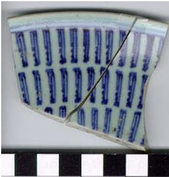
Chinese ceramic 'Patten 21'

A comparison of the rim diameters of these vessels with pottery from the Sydney Cove shipwreck helps provide some idea of what complete forms may have looked like (Table 1000.21). 11 The rim diameters of the two tea saucers at 140 mm was generally smaller than those found on the Sydney Cove where the rim diameter were 156-158 mm. The plate with a diameter of 140 mm, is much smaller than Sydney Cove dinner plates which had a diameter of 236 mm. The plate with a diameter of 220 mm was similar in size to Sydney Cove plates. The bowl diameters of 180, 200 and 240 mm are in line with the diameters on Sydney Cove nested bowls types 1, 2 and 3. 12 They are larger than individual rice bowls and were possibly used in the home of an European person as a serving bowl on a table or as an ornament. None of the identifiable decorations from the Verbrugghen Hall vessels were the same as those from the Sydney Cove . The Pattern 21 bowls are similar to ones found in the Rocks, such as at Samson's Cottage. 13 None of the identifiable vessels were rice bowls which would have been used by Chinese people as a normal part of a meal. In 1809, sales of Chinese vessels included China cups and saucers at 2 shillings 6 pence each, which was one-tenth the price paid for salvaged ceramics from the Sydney Cove in 1798. 14